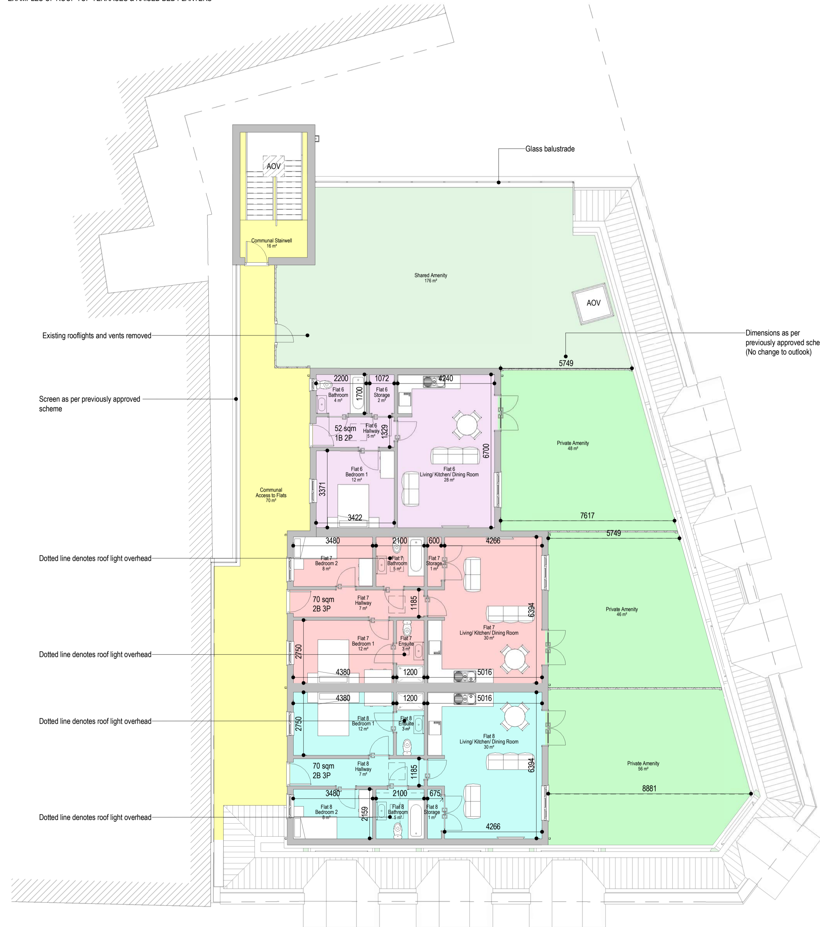
1 Proposed - Second Floor 1 : 100