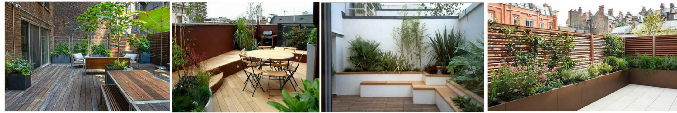
EXAMPLES OF ROOF TOP TERRACES & RAISED BED PLANTERS